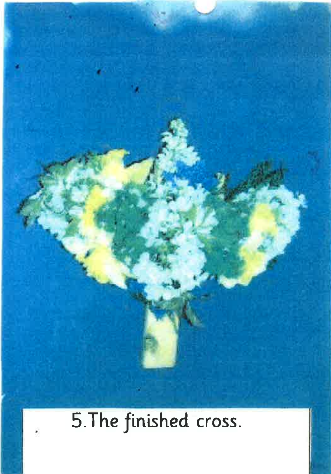
5. The finished cross.